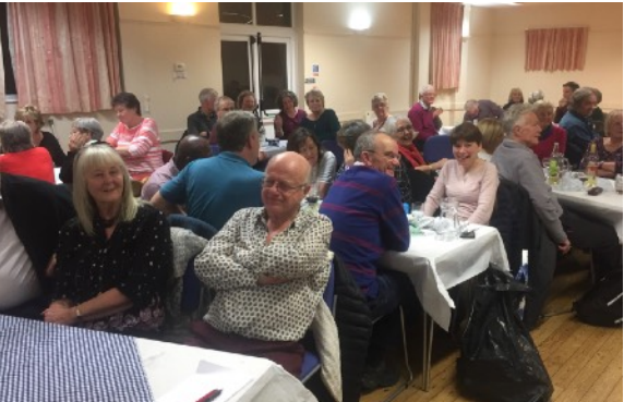
Thinking caps about to go on!