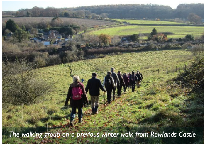
The walking group on a previous winter walk from Rowlands Castle